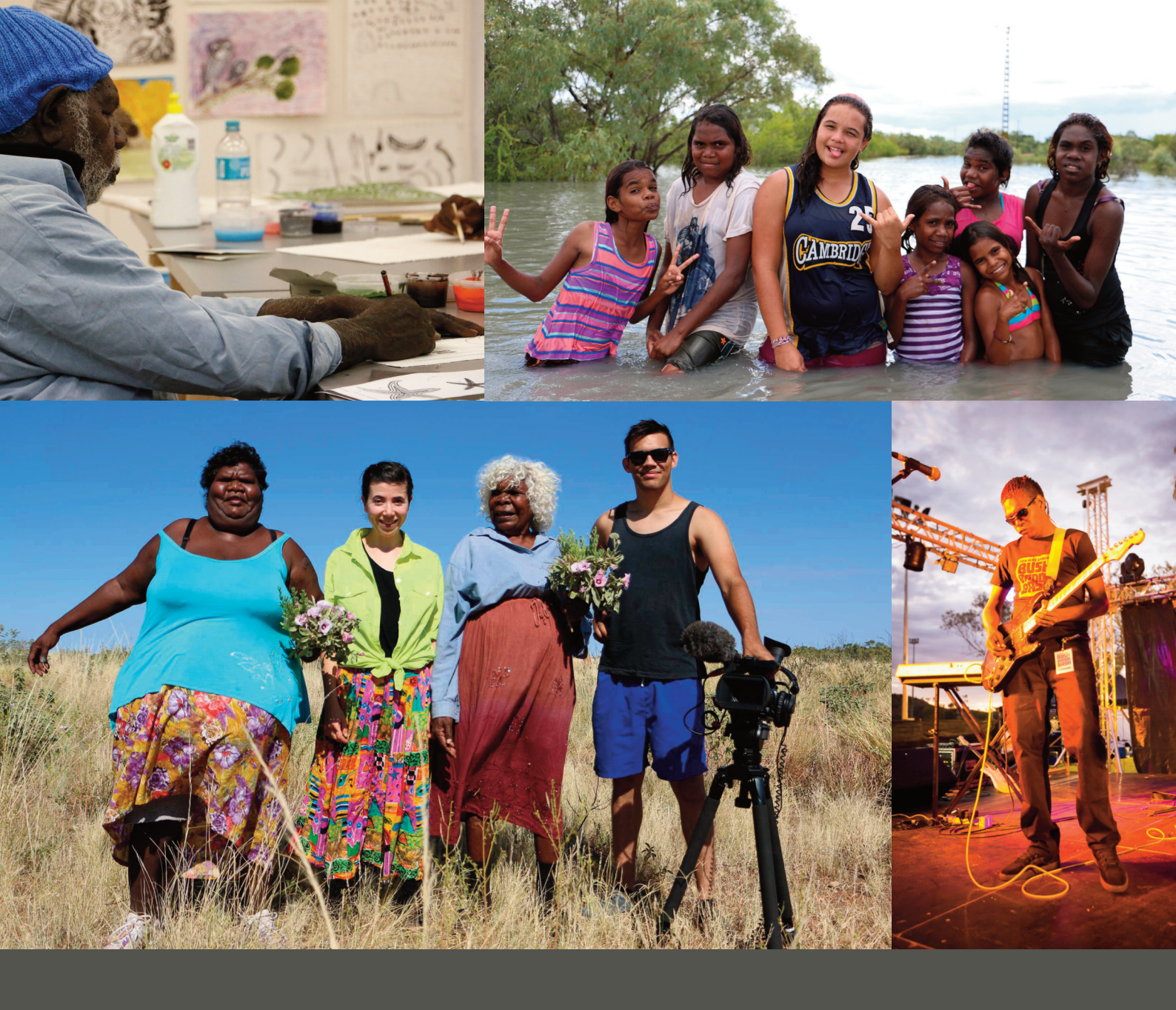
"We live in a region of extremes ..."