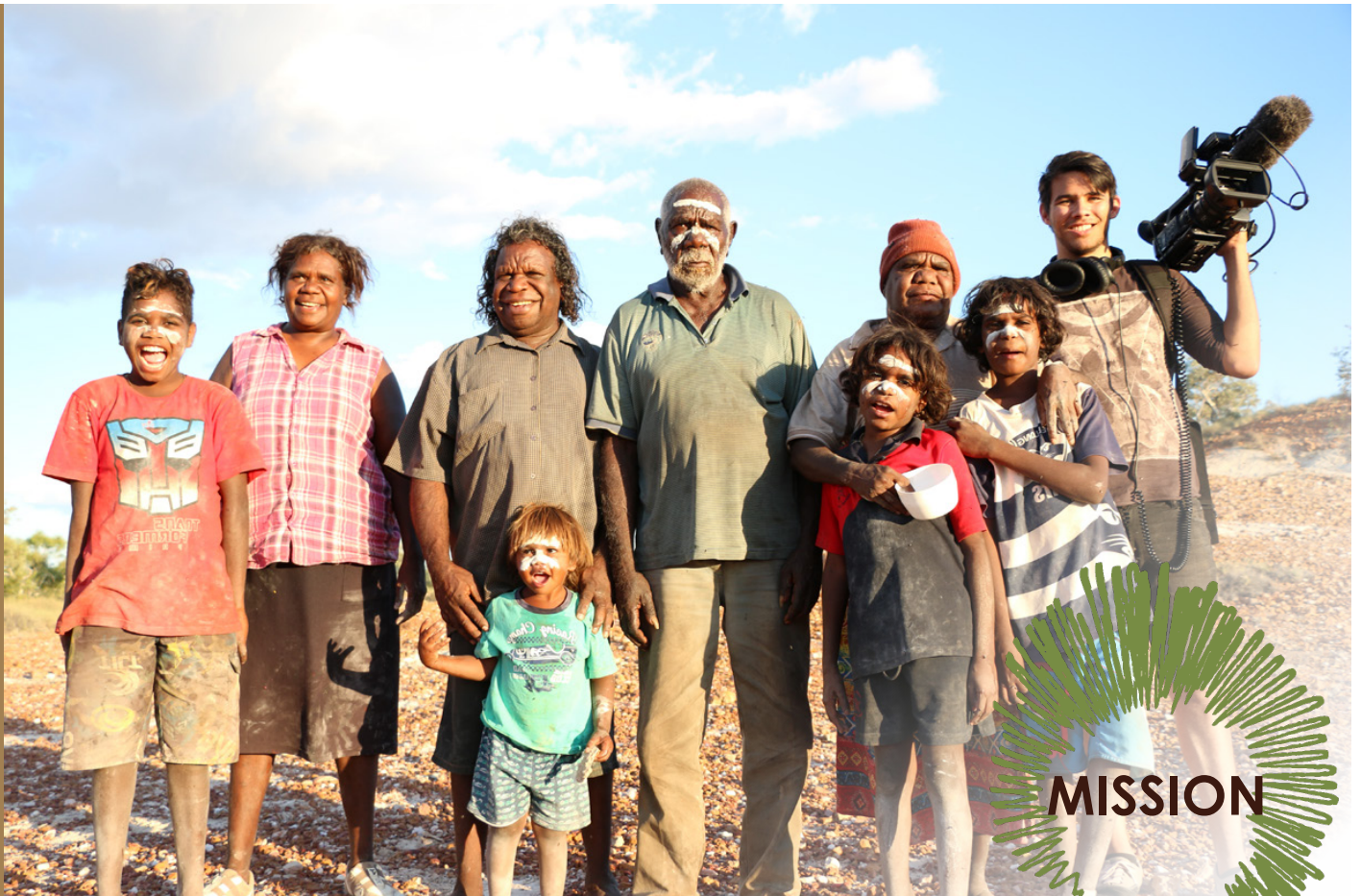
A Place Called Walanpampa, living culture documentary

'The enduring purpose of BRA is to add living culture to the artistic merit of Australia whilst contributing creative industry opportunities in very remote communities.'