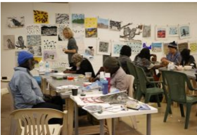
Barkly Artist Camp