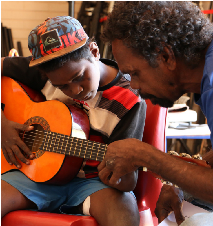
WMC men teaching anti-social kids, music